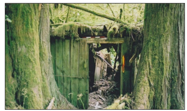
Figure 6. A 2006 view of the "dynamite shed" in the northwest aspect of Port Douglas town-site, looking east.

Douglas First Nation. There are several standing grave markers made of wood, stone, and concrete, and several low and elongated earthen mounds which appear to be unmarked graves.