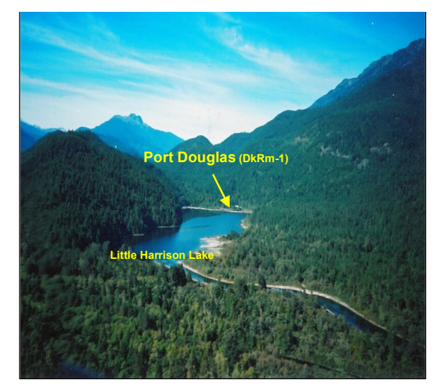
Figure 2. View of Port Douglas town-site at the north end of Little Harrison Lake, looking north.

This chapter deals primarily with early post-contact period colonial interest at Port Douglas (Figures 3 and 4), and its archaeological research potential and heritage significance. While this locality was once a major economic and strategic focus for European colonial development, First Nation peoples have occupied Little Harrison Lake and adjacent Harrison Lake and Lower Lillooet Valleys since time immemorial, and their participation in the local colonial process should not be overlooked or understated.