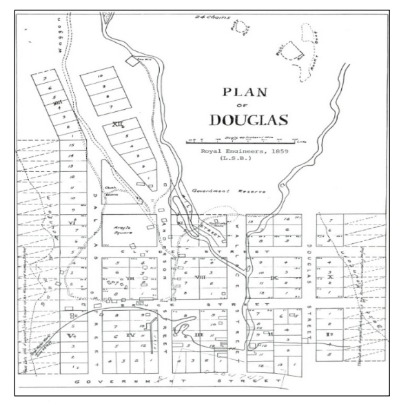
Figure 4. City plan map of Port Douglas produced in 1859 showing streets and property boundaries. Map from Royal Engineers (1859).

from the Harrison Lake to the Tenass Lake." (Palmer 1859:230). Palmer also concluded, that since, "...Indian trails throughout North America invariably follow the best line of travel through a wild country... at least a great portion of the [Harrison-Lillooet] road should be carried along that bank." Colonial developments, including construction of Port Douglas, often involve and reflect First Nation land-use patterns, and "indigenous settlement histories" (Belshaw 2009: 36).