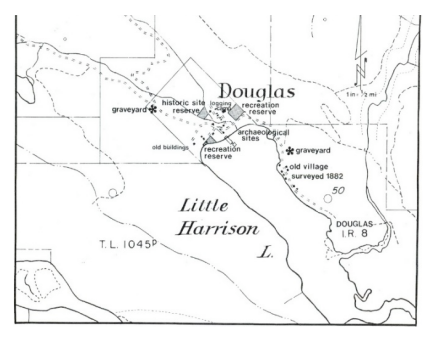
Figure 3. Location of Port Douglas town-site at the north end of Little Harrison Lake indicating local infrastructure. Map from HCB (1980, Volume I: 59).

cascading social and political ramifications. For Colonial officials, the Fraser River Gold Rush created a pressure to amalgamate the Vancouver Island colony with territories on the mainland. The development of transportation infrastructure was central to this end, and construction of a reliable system of pedestrian and wagon-road routes across the Coast Mountains into the mainland interior was considered with a sense of urgency. Transportation infrastructure was needed to, "...improve the internal communications of the country...", and in regard to the mountain pass beyond Fort Yale, "...interpose an almost insurmountable barrier to the progress of trade" (Douglas 1858 in Sterne 1998: 103). Prior to completion of the Canadian Pacific Railway in 1885, and several wellengineered wagon roads in the 1860s, the only transportation route to the interior's open county was via treacherous pack trails ill-suited for the heavy traffic of a burgeoning Gold Rush (Johnson 1996:176-179). To encourage growth of British controlled resource-based economies, an aggressive program of trail and road development was initiated. This provided access to previously inaccessible lands and resources which stimulated ranching and industry and, most notably, encouraged traffic through the newly amalgamated British colony.