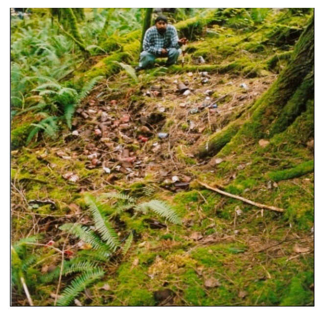
Figure 7. A domestic refuse dump in the northwest aspect of Port Douglas town-site, looking southwest.

In 2006, Rousseau et al. (2007) visited nearby archaeological site DkRm-3, where they observed cultural materials on the ground surface. This site is located about 1.2 km south of Port Douglas on Douglas Indian Reserve 8 and is situated on the east shore of Little Harrison Lake (Figure 5). Low to medium density scatters consisting of approximately 20 siltstone and chert flakes, fire-altered rock, and charcoal. Two formed biface fragments were recovered. Early postcontact period artifacts were also observed on the ground surface in low to medium density scatters, which included: bottle glass and ceramic shards, various metal artifacts, two "cobalt blue" glass "trade" beads, and a clay pipe stem fragment which likely dates to the mid- to late 1800s. Rousseau et al. (2007) suggests that inhabitants of DkRm-3 and Port Douglas may have interacted during the late 1800s