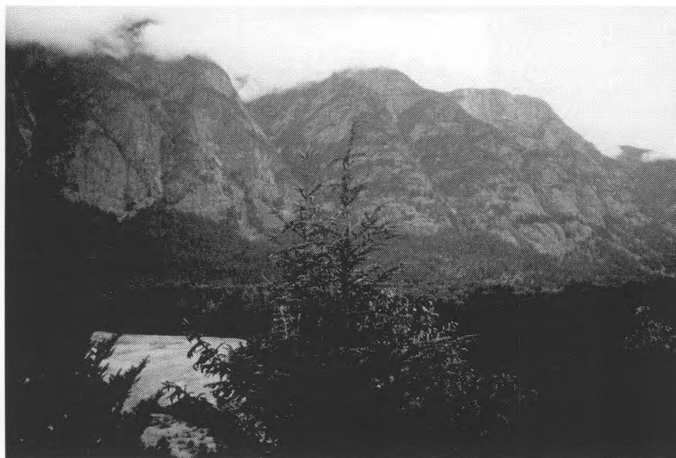
Figure 2:2. View across the Bella Coola Valley from the Tsini Tsini Site, looking North.

In the Smithers-Terrace-Prince Rupert area, the outer coast was the first area to be deglaciated. This occurred approximately 13,000 [cal 15,600] BP (Clague 1984:1, 1985:256). Evidence from the Prince Rupert, Kitimat, and Bella