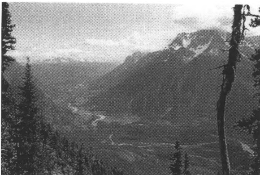
Figure 2:3. Looking East at the upper Bella Coola Valley immediately down-river from the Tsini Tsini Site. At the time of occupation at Tsini Tsini this valley was an arm of the sea.

have been the direct result of the various increases in rainfall that are known to have occurred during the Holocene. This flooding could have occurred during the transition from the Hypsithermal to the cooler and wetter period around 7000 BP (Hebda 1995:55, 77) or alternatively, it could have occurred during the Neoglacial advance between 3500 and 2500 BP (Desloges and Ryder 1990:289; Retherford 1972:3). It does not appear that this flooding could be related to the little Ice Age advance in the valley, as this advance would have occurred in relatively recent memory. Secondly, it could be possible that the flood referred to specifically in Nuxalk oral traditions may be referring to the presence of the coalescing delta dammed lake that is thought to have had a short presence in the valley between 11,000-10,000 [cal 13,000-11,400] BP between the Nusatsum and Salloomt rivers (Retherford 1972:112). This coalesced delta would have dammed the Bella Coola valley and most likely caused flooding once the dam broke. Determining which of these possible alternatives (or any other alternative) is responsible for the creation of this flood story is problematic as there does not appear to be enough specific information within Nuxalk oral histories to rule out any one possibility.