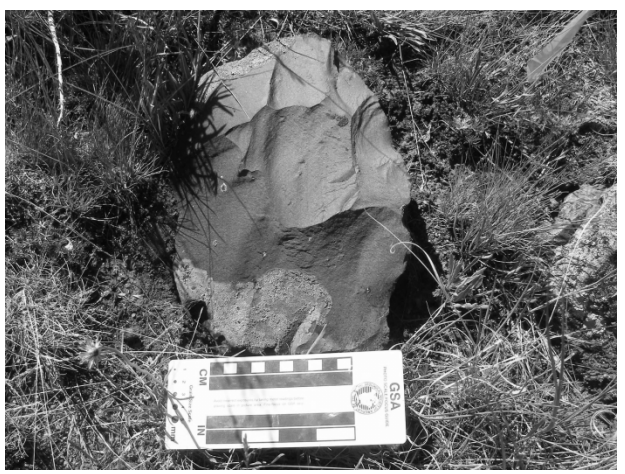
Figure 10-10. Biface at a quarry site on Craig Mountain.

single flake scar were classified as tested raw material. (One of the "quarry" sites included here was composed of tested raw material and relatively few flakes and may represent a "prospect" locale rather than a quarry [see Wilke and Schroth 1989].) Very few cores were found that were exhausted or were small in size.