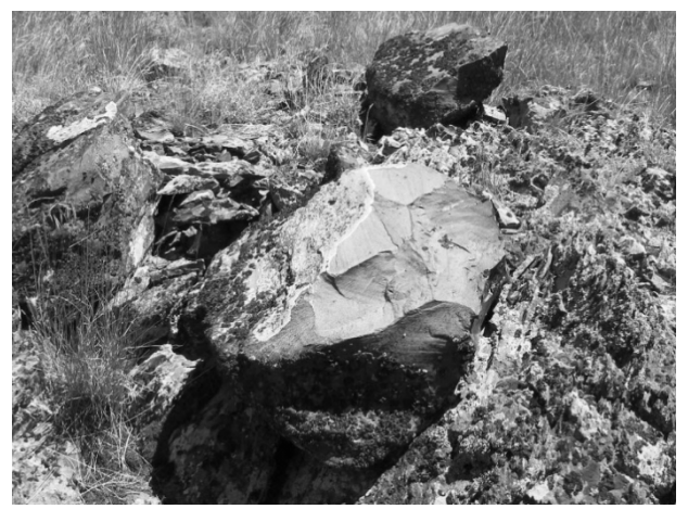
Figure 10-8. Negative flake scars on boulder of raw material showing evidence of "block on block" technique.

with long flake scars extending towards the center of the artifact (Figures 10-9 and 10-10). The large bifaces appear to be similar to the bifacial blanks described by Womack (1977) and might have been more easily transported than multidirectional cores or other core forms. Primary geologic cortex was present on many of the bifaces and cores at both quarry sites and lithic scatter sites.