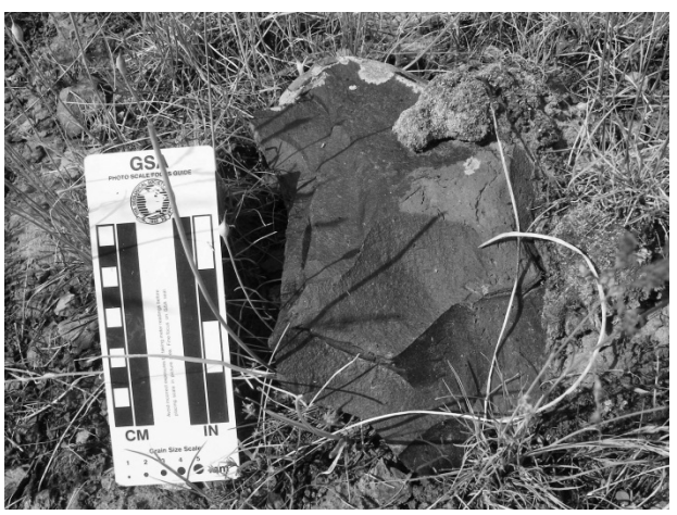
Figure 10-7. Negative flake scars on large cobble of raw material at a quarry site on Craig Mountain.

and systematically reduced to create cores and blanks suitable for export (Figure 10-6). Many of the cobbles are tabular in form and were reduced directly into large bifaces by beveling the angular or square margins. Immovable boulders of raw material frequently displayed large negative flake scars and signs of battering (Figure 10-7). Often, the edges of the boulders did not appear to support the correct angles for removal of flakes with a hammerstone. Step fractures were common in the debitage and on the negative flake scars visible on raw material. These observations are best explained by use of the "block on block" technique described by Womack (1977), whereby large boulders served as either cores or as anvils to strike cores against, or both (Figure 10-8). The large flakes removed from boulders were used to produce large bifaces, which then served as bifacial cores or blanks. Very few finished tool types were observed at the quarry sites-these consisted of a total of two scrapers, one pressure-flaked biface midsection, and some possible flake tools (edge-modified or edgedamaged flakes).