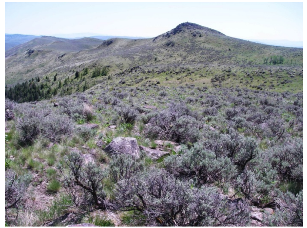
Figure 10-3. Overview of a quarry site on Craig Mountain. The view is toward the southeast along the main ridgeline of Craig Mountain.

used for the rest of the project, with the exception that shovel testing was not done within the site boundary per Oregon SHPO guidelines. The survey results indicate that site 35UN52 contains discrete concentrations of surface artifacts or single items separated by large areas of land where no artifacts are present on the surface, similar to the distribution of archaeological sites and isolates across the rest of Craig Mountain.