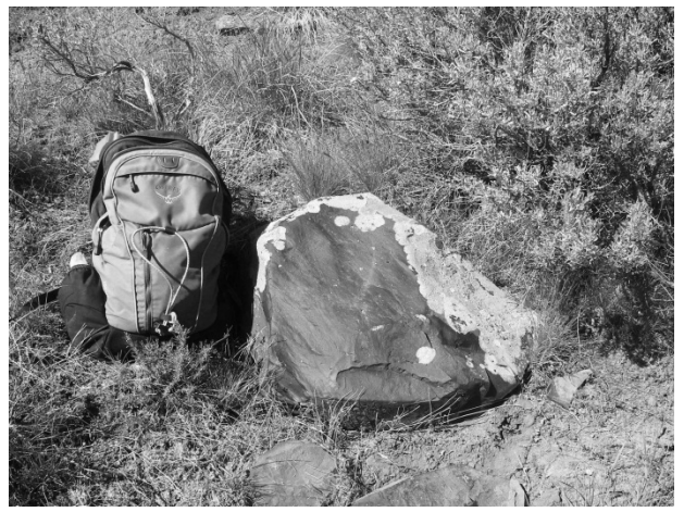
Figure 10-5. Negative flake scars on boulder of raw material at a quarry site on Craig Mountain.

AINW, mainly on ridges and slopes where sediments are shallow, stand in contrast to the more well-known portion of the site where dense, stratified archaeological deposits have been the focus of previous research (Cochran and Leonhardy 1981; Womack 1977; McPherson, Hall, McGlone, and Nachtwey 1981). These observations also reflect the way in which the 3,400-acre site originally boundary was recorded using topographic extrapolation (Johnson et al. 1980:2; Reed 1980). Based on the distribution of quarry "sites" identified across Craig Mountain and nearby landforms, it is suggested that the Stockhoff Ouarry be considered part of a larger quarry complex.