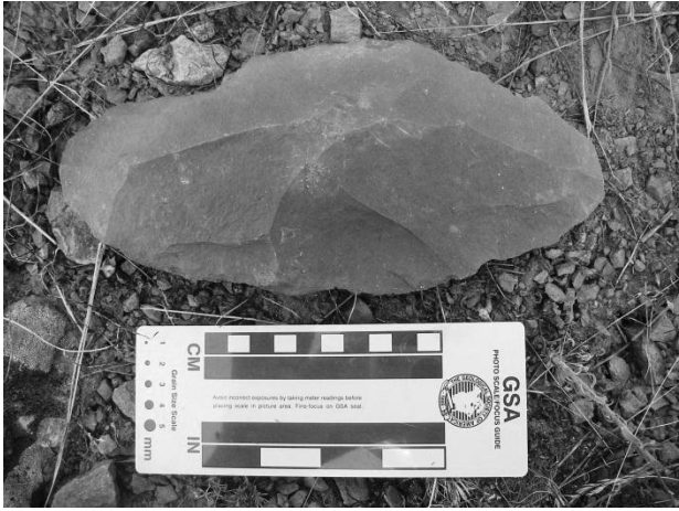
Figure 10-9. Biface at a quarry site on Craig Mountain.

Unidirectional, multidirectional, and bifacial core reduction strategies were all represented in the assemblage of cores, from which flake blanks and flake tools were made using direct freehand percussion on cobbles and boulders. Cores were common at quarry sites and tended to range in size from 10 to 30 cm in diameter. In the field, tools that displayed more than one negative flake scar were classified as cores, while materials exhibiting a