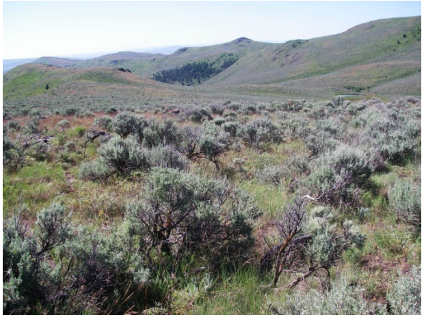
Figure 10-4. Overview of another quarry site on Craig Mountain. The view is toward the south.

The 29 archaeological sites classified as quarries (including site 35UN52) exhibited evidence of lithic procurement focused on geological deposits of FGV material that occur mainly as tabular, subrounded to sub-angular cobbles and boulders, and in some locations as bedrock outcrops. Toolstone was procured from primary geological deposits consisting of boulders and cobbles eroded from weathering lava flows as well as bedrock outcrops, and from secondary deposits including colluvial and fluvial deposits. No evidence of mining or subsurface extraction was observed, as boulders and cobbles of high-quality FGV material were exposed on the ground surface (Figure 10-5). Culturally modified and unmodified boulders and cobbles of this raw material were abundant within the quarry sites. These sources of toolstone would have been attractive because of their excellent conchoidal fracture characteristics, sharp and durable edges, and large size. Large-sized lithic raw materials facilitate long use-lives of stone tools by