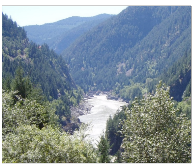
Figure 3. A view of the Fraser upstream from Hells Gate (center photo), looking south.

A prevalent and very culturally significant natural aspect of the Lower Fraser Canyon is the very warm, dry, forceful and consistently relentless wind that blows from early Summer through to early Fall. It quickly dries prepared salmon sides hung on drying racks constructed alongside the River on top of well-exposed bedrock outcrops and on open terrace edges exposed to the wind (Figure 5). The strong wind also assists in keeping flies from lighting on the exposed flesh during the drying process.