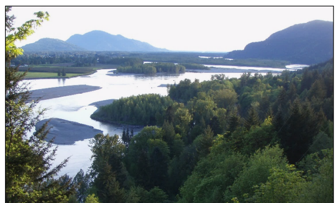
Figure 15. The west-central aspect of the Fraser Valley sub-region near the confluence of the Fraser and Harrison Rivers, looking southwest.

Large marshlands were also common and of considerable importance during the pre-contact period. The large Pitt Polder marshland near Maple Ridge, which prior to its diking and draining in the late 1800s and again in the early 1950s (Collins 1975), flooded annually, providing ideal habitat for migratory game birds and perfect conditions for sustained proliferation of several important edible plant species (Chapters 11, 16 and 28). Prior to being drained and diked in 1924, former Sumas Lake near Sardis provided a similar habitat during the pre-contact period, but unlike Pitt Polder which is closer to the Salish Sea, it was not affected by tidal fluctuations. These, and other similar marshlands were routinely visited by Stó:lō people to exploit aquatic food resources (Duffield and McHalsie 2001:63).