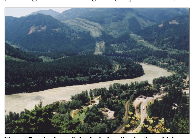
Figure 7. A view of the Yale locality in the mid-Lower Fraser Canyon sub-region, looking south over the well-known South Yale site (center), looking southwest.

In many valley-bottom localities there are a fair number of large depressions that have been created naturally by growth-expansion and post-mortem rotting of very large cedar and fir tree roots. Some of these circular and oval depressions measure up to 6 m across and are 1 m deep. In well-drained contexts they present themselves as ready-made foundations for small temporary dwellings erected at field camps, as wind-protected and hidden places to rest or spend a few nights, and as hunting blinds for ambushing game. It seems logical to me that regular opportunistic use of these natural root-rot depressions during the mid-Holocene may have provided some inspiration for construction of early semi-subterranean houses in the region, with perhaps both natural depressions and artificial (hand-dug) foundations being used (Chapters 9 and 25).