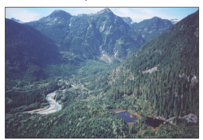
Figure 19. A view of the Upper Stave River Valley in the North Lakes sub-region, looking northwest.

In many localities along the east and west sides of these large lakes there are numerous creek deltas and glacial kame and outwash terraces very well-suited for pre-contact period human occupation and pedestrian travel. The north ends of these lakes are also linked with significant river and stream valleys that were, and still are, regularly travelled by animals and people. Also included in this sub-region are a few secondary E-W trending drainage valleys containing lesser high-energy rivers, countless creeks and streams, small lakes, marshes and ponds.