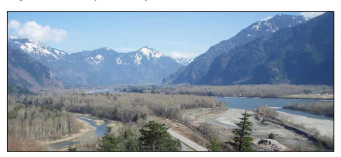
Figure 9. A general view of the Johnson Slough locality (foreground) in the northeastern aspect of the Fraser Valley sub-region, looking northeast toward the town of Hope.

This classic "riverine" realm extends south (downstream) from the town of Hope, then westward at Chilliwack, and ends at the confluence of the Pitt and Fraser Rivers and city of White Rock in the west (Figures 9 to 17). Its northern boundary corresponds with the southern ends of the large lakes in the North Lakes sub-region, and the southern boundary is the Canada/US border. Annual precipitation averages 150 cm, with most of it falling along the northern edge of the valley bottom just south of the Coast Mountains.