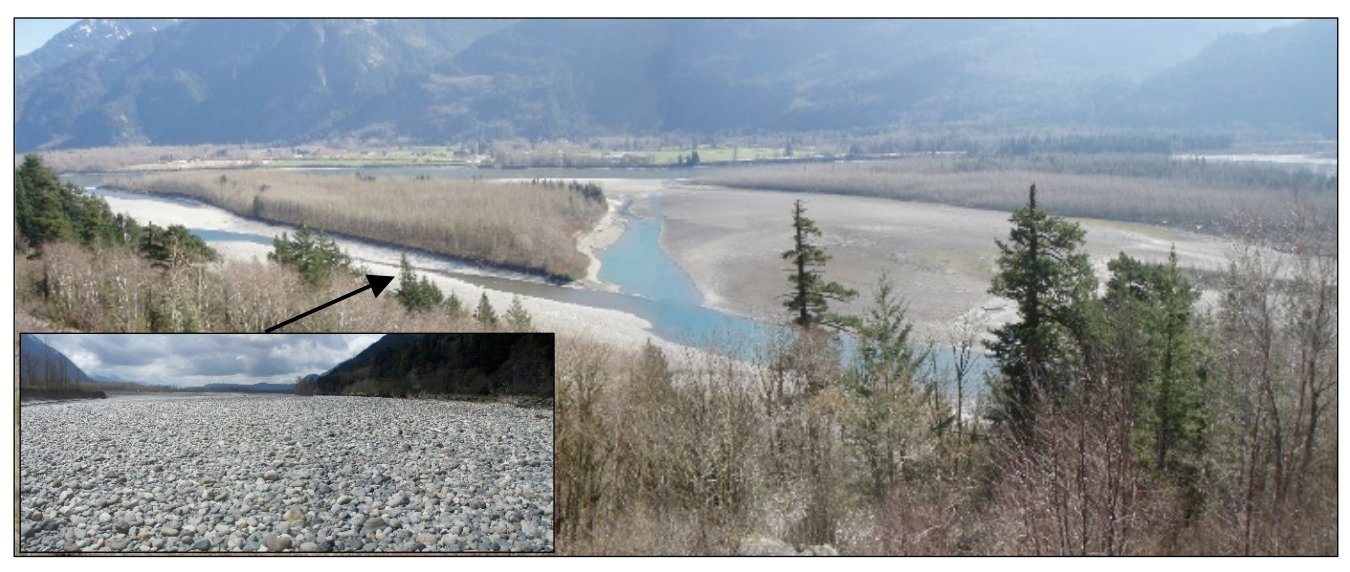
Figure 11. A view of extensive exposed cobble/gravel bars containing an abundance of flakable toolstone cobbles (inset photo) in the Johnson Slough locality upstream from Agassiz, looking northeast.

During low water in the late Fall and Winter, extensive gravel/cobble bars become exposed between Hope and Mission. They contain an abundance and variety of toolstones, including nephrite and other nephrite-like rocks from the Coquihalla River (Chapter 27), a wide variety of microcrystalline silicate metasediments, microcrystalline quartzites, a surprising variety of good to high quality cryptocrystalline cherts and chalcedonies, and varying