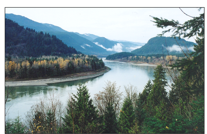
Figure 8. A view of the southern Lower Fraser Canyon sub-region a few km upstream (north) of the town of Hope, looking northwest.

The southern section of the Lower Fraser Canyon below Yale has very high archaeological site density, with numerous large multi-component sites containing lithic scatters that extend hundreds of metres along terraces at all elevations.