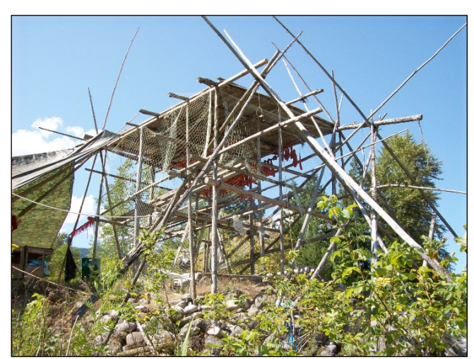
Figure 5. The Hope family salmon drying rack south of Yale. Direct exposure to warm, dry, persistently forceful wind is key for rapid and proper drying. Racks constructed on bedrock outcrops and open terrace edges afford the best drying conditions, and rising air heated by adjacent rocks exposed to the sun is also beneficial.

These early written accounts very concisely capture the natural rawness of this dynamic and sometimes unforgiving landscape, but there are also numerous, isolated to fairly large, level to slightly inclined landforms spread along the canyon sides and bottoms. These include the more easily travelled glacial kame and outwash terraces in mid-altitude canyon-side contexts, and hundreds of stepped lower river terraces carved out over the last 10,000 years (Figures 2, 4, 7 and 8). These terraced localities provided many ideal opportunities for pre-contact period human settlement and use, and past intensive archaeological investigations conducted in the canyon demonstrate that site densities are high, and some larger sites in choice locations have long and intensive occupational histories. Some upper terraces are quite extensive and habitable, and it can assumed with some certainty that many contain occupations predating 7500 BP.