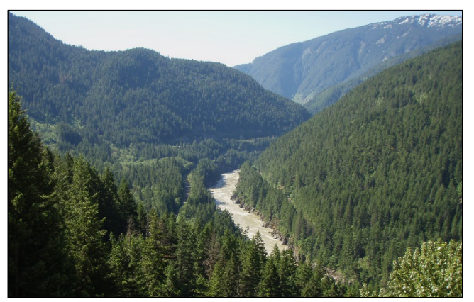
Figure 4. A view of the Fraser River a few kilometres downstream from Hells Gate the north aspect of the Lower Fraser Canyon sub-region, looking south.

where migrating salmon congregate and rest during their upstream quest, making them vulnerable to the skills of expert dip-netters. These bedrock protrusions also provide ideal windswept locations for construction of salmon drying racks.