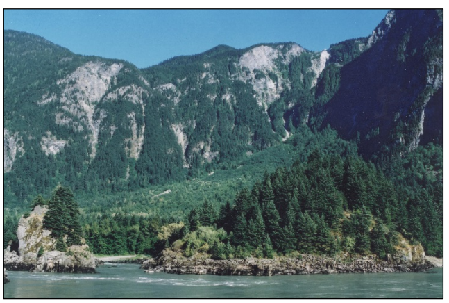
Figure 6. A view of Lady Franklin Rock (lower left) near the Esilao/Milliken locality in the mid-Lower Fraser Canyon near Yale, looking east.

Along the sides of the Fraser River, small isolated gravel bars and river channel sides become exposed in late Fall to early Spring, providing access to a variety of flakable silicate toolstones carried great distances by the river from a multitude of local and upstream parent source locations. Local outcrops of shale and slate are also very common, and these materials were sometimes used to make simple edgeground knives.