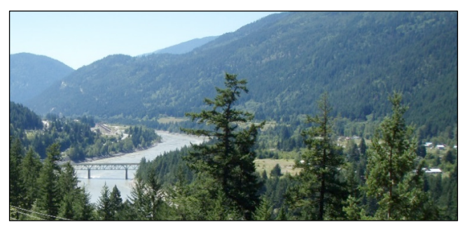
Figure 2. A view of the Boston Bar locality at the north end of the Lower Fraser Canyon sub-region, looking southwest. Extensive river terraces in this locality, and others like it to the south, have been continuously occupied by people for many millennia.

deer, coyote, hare, porcupine, grouse, anadromous salmon, white sturgeon, a variety of other resident fish, marmots and several other species of rodents, and freshwater mussels are present in some creeks.