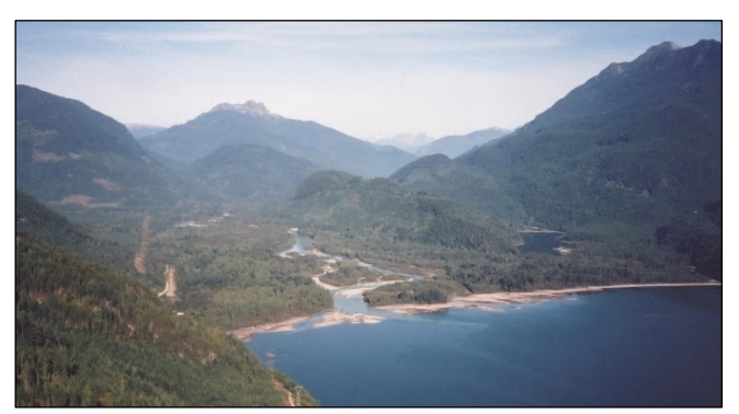
Figure 18. The north end of Harrison Lake and south end of the Lillooet River Valley, looking northeast.

In many localities along the east and west sides of these large lakes there are numerous creek deltas and glacial kame and outwash terraces very well-suited for pre-contact period human occupation and pedestrian travel. The north ends of these lakes are also linked with significant river and stream valleys that were, and still are, regularly travelled by animals and people. Also included in this sub-region are a few secondary E-W trending drainage valleys containing lesser high-energy rivers, countless creeks and streams, small lakes, marshes and ponds.