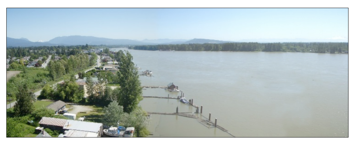
Figure 16. A view of the Fraser River in the western aspect of the Fraser Valley sub-region looking east from the Golden Ears Bridge toward the city of Maple Ridge (left).

Pre-contact period flora and fauna in the Fraser Valley were abundant and varied. Game was plentiful, and included mule deer, elk, hare, grouse, beaver, and a variety of small rodents and birds. The valley is also host to many thousands of migratory and resident water-fowl, including swans, geese, ducks, and other game species that were hunted in marshlands with slings (Chapter 17). From early spring to late fall, salmon were (and still are) available in many drainages, and were routinely and intensively targeted as a major source of both immediately consumable (fresh) and stored (dried) protein. Sturgeon were also present year-round in the Fraser River and its larger tributary rivers such as the Harrison, Stave and Pitt Rivers (Chapter 14). Many lesser fish species (e.g., rainbow trout, char, whitefish, suckers, etc.) were also regularly exploited when available.