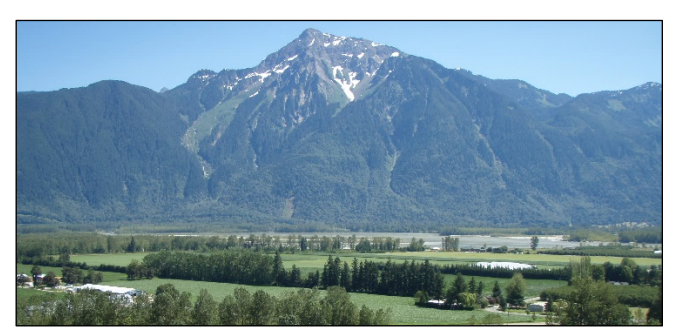
Figure 12. A view of Mount Cheam and the eastern Fraser Valley lowlands in the Agassiz locality, looking east

Several prominent bedrock protrusions and larger "haystack" mountains rise from the valley floor (i.e., Chilliwack Mountain, Sumas Mountain, Sheridan Hill, Snake Rock and Codd Island); most have great traditional and spiritual importance and ethnic significance to their respective First Nation peoples. Other prime localities well-suited for precontact period occupation include the low to mid-altitude, undulating, incised, rounded and forested hills now lying within and near the cities of Mission, Abbotsford, Maple Ridge, Fort Langley, Langley, Surrey and Cloverdale.