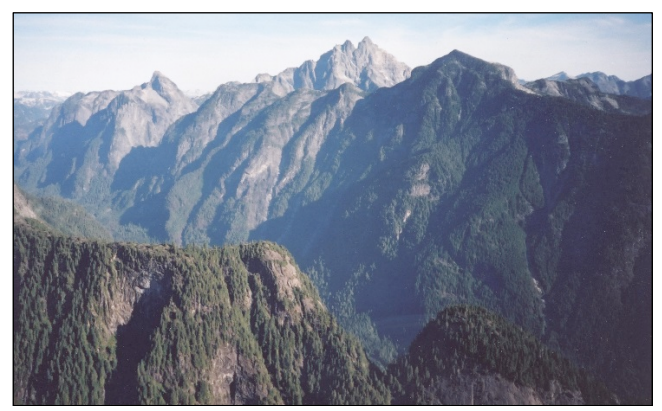
Figure 20. Extremely rugged and steep terrain of the southern Coast Mountain range dominates most of the North Lakes sub-region.

The North Lakes sub-region receives approximately 100 cm of precipitation annually, which is less than the Fraser Canyon to the east and Fraser Valley to the south. This is due to high, steep-sided, glacially-sculpted Coast Mountains that rise abruptly from valley floors and create a rain-shadow (Figures 10 and 18 to 20). High snow packs feed small streams and creeks well into the summer months. Large talus slopes flank mountain bases. Most U- or V-shaped valley bottoms have extremely rugged undulating rocky terrain strewn with boulders of all size, with some stepped glacial and fluvial terracing, high-energy stream and river floodplains and channel scarring. Since there is little or no public vehicle access into many of the upper reaches of the valleys in this sub-region, a fair number of remote valley-bottom localities still remain naturally pristine.