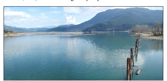
Figure 17. A view of the Harrison River upstream from its confluence with the Fraser River, looking north.

Pre-contact period flora and fauna in the Fraser Valley were abundant and varied. Game was plentiful, and included mule deer, elk, hare, grouse, beaver, and a variety of small rodents and birds. The valley is also host to many thousands of migratory and resident water-fowl, including swans, geese, ducks, and other game species that were hunted in marshlands with slings (Chapter 17). From early spring to late fall, salmon were (and still are) available in many drainages, and were routinely and intensively targeted as a major source of both immediately consumable (fresh) and stored (dried) protein. Sturgeon were also present year-round in the Fraser River and its larger tributary rivers such as the Harrison, Stave and Pitt Rivers (Chapter 14). Many lesser fish species (e.g., rainbow trout, char, whitefish, suckers, etc.) were also regularly exploited when available.